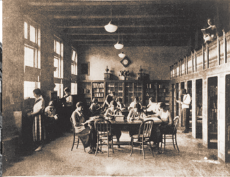
THE LIBRARY AND READING ROOM