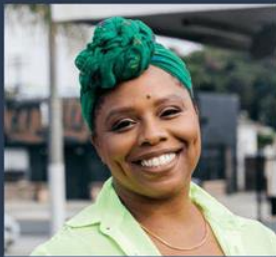
Patrisse Cullors, Co-Founder of Black Lives Matter & Best-Selling Author of When They Call You a Terrorist

Join us for an intercollegiate virtual conversation featuring