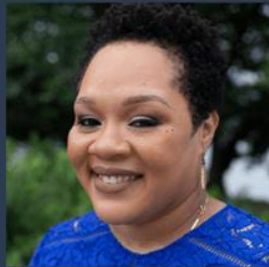
Yamiche Alcindor, White House Correspondent for PBS NewsHour & NBC and MSNBC Political Contributor