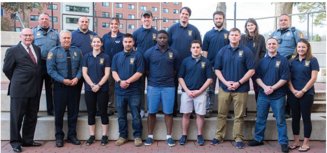
2017 Citizens Police Academy Graduates

The dean of student affairs may change the victim's academic schedule if requested by the victim to avoid contact with the accused. If the victim lives on campus, the Office of Residence Life will, at the victim's request,