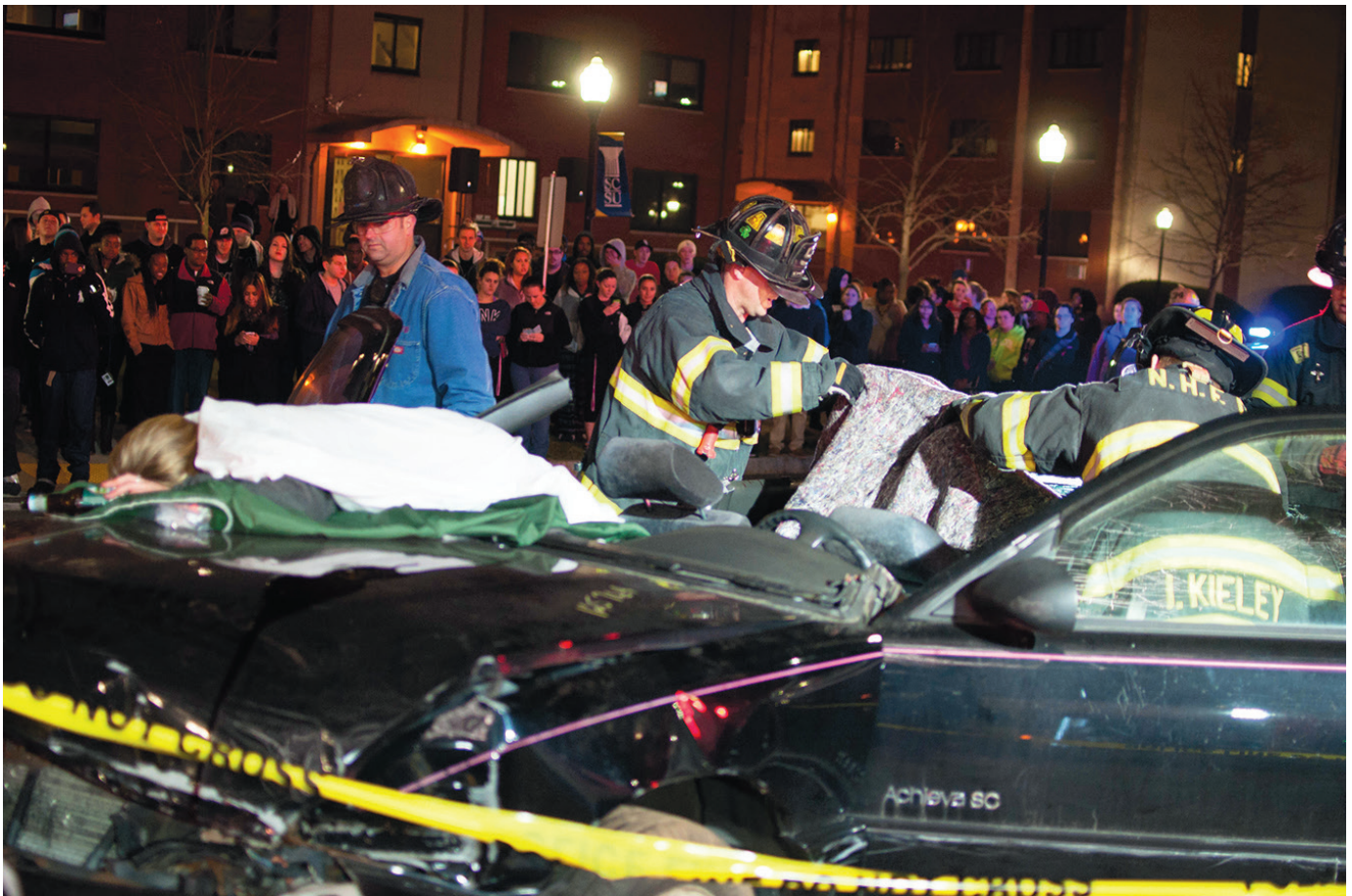
Students observe the consequences of drinking and driving during the Mock Crash demonstration.

(b) STATUTORY RAPE (UCR code 36B) Non-forcible sexual intercourse with a person who is under the statutory age of consent.