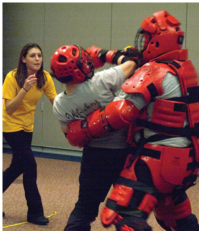
Rape Aggression Defense Class

The Southern Police Department provides a shuttle bus service and all of the shuttles are handicapped accessible. Currently, there are 10 enclosed bus stops located throughout the campus in high pedestrian traffic areas. On-Campus service is available Monday–Thursday from 7:30 a.m.–11:00 p.m. and Fridays from 7:30 a.m. to 5 p.m. The shuttle can be easily accessed in front of Hickerson Hall or by calling First Transit at 203-281-5470 until 11:00 p.m. Shuttles will also go to Union Station, New Haven, on Friday from 7 a.m. until 5 p.m., and the