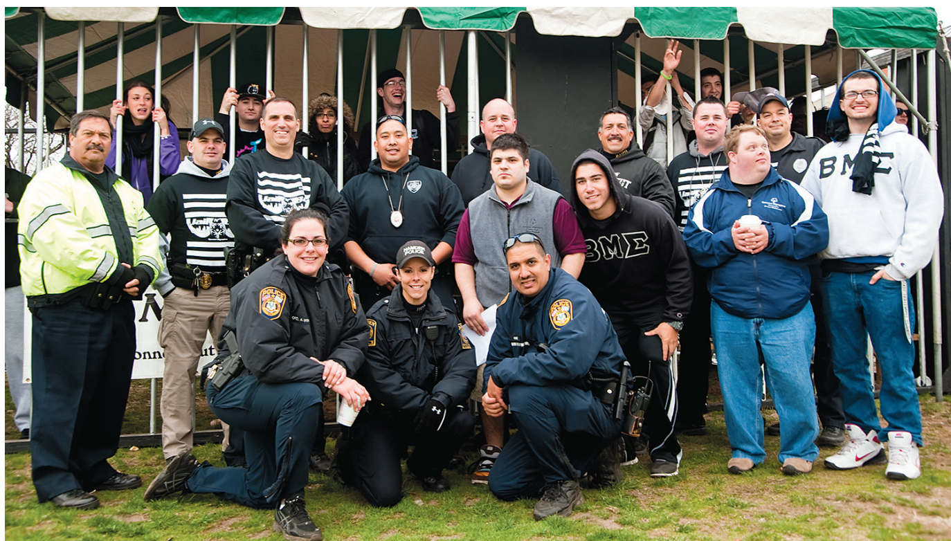
Annual Jail 'n' Bail charity event

RESIDENTIAL FACILITY: Dormitories or other residential facilities for students on campus is a subset of the on-campus category. Institutions must disclose the total number of on-campus crimes, including those in dorms or other residential facilities for students on campus, and must also make a separate disclosure limited to the number of crimes occurring in student dorms or residential facilities on campus.