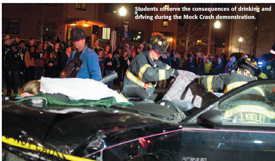
Students observe the consequences of drinking and driving during the Mock Crash demonstration.