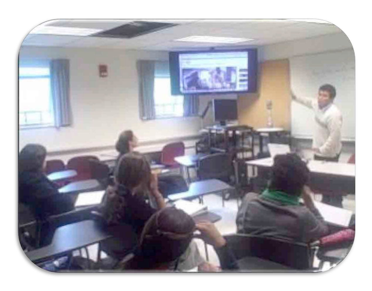
Culture of Expression, Open Class, 2011.