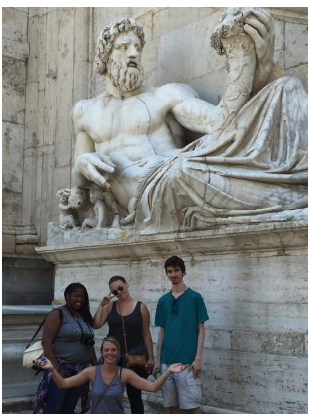
SCSU Tuscany, students in Rome