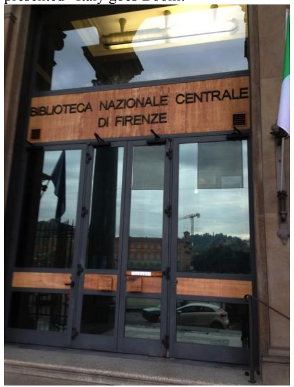
Biblioteca Nazionale Firenze

The Fascist ghost town in Antonioni's L'Avventura" at Nightmare Spaces/Uncanny Places: the 13<sup>th</sup> Annual Conference of the International Association for the Study of